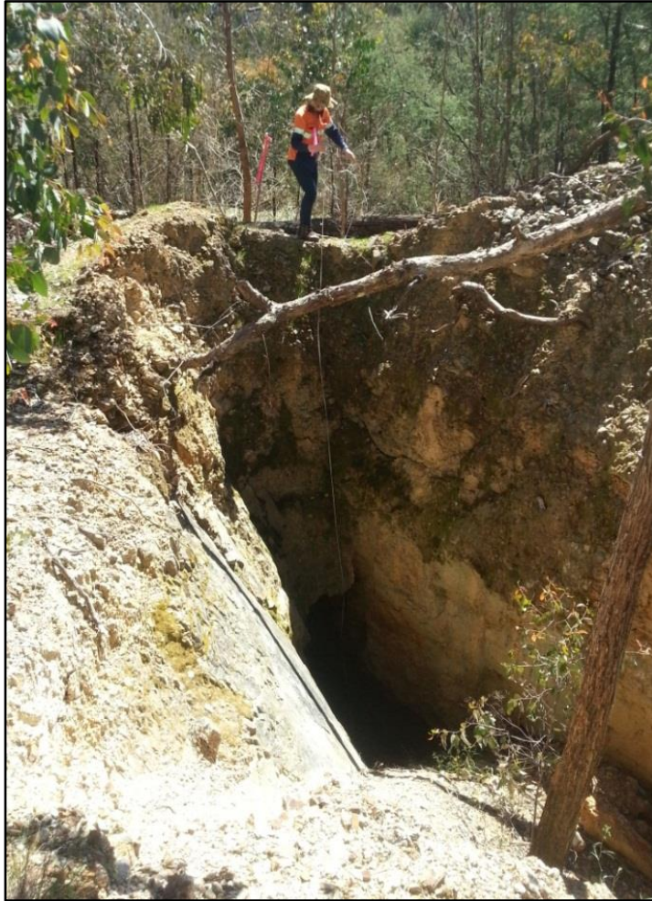
Photo 1 One of the Old Apollo Gold Workings

Detailed geological surface mapping, followed by selective costeaning (trenching) will be employed as first steps in exploring the Clonbinane Goldfield. Geological surface mapping has commenced. Where mineralisation outcrops at surface, trial mining / bulk sampling could then be employed in addition to close-pattern RC (reverse circulation percussion) drilling.