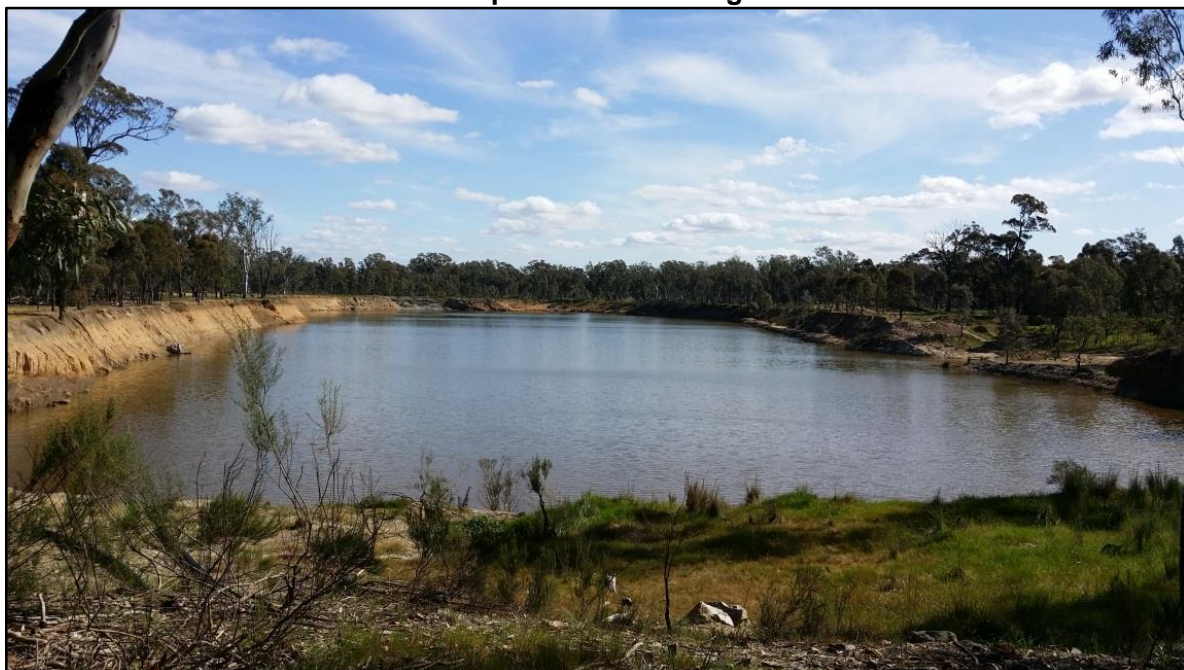
Photo 2 West Pit Construction Spoil Site at the Nagambie Mine

In recent months, Nagambie Mining has become aware that the open pits at the Mine represent ideal under-water sites for potential acid sulphate spoil from construction projects in Melbourne. The first proposed site, the West Pit (refer Photo 2), has a volume of 1.4 million cubic metres below the water surface and could take up to around 2.7 million tonnes of spoil. Work has commenced on the preparation of an Environmental Management Plan in regards to the West Pit site.