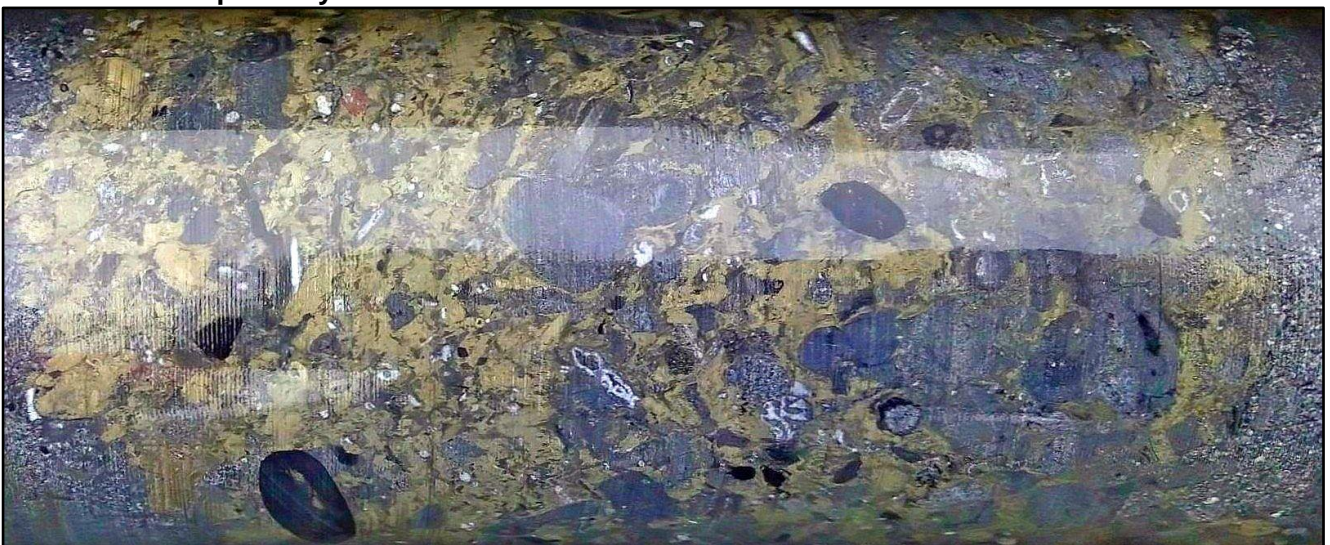
Photo 1 Example of Pyritic Fossil Beds Intersected in CAD001

The pyrite in the fossil beds is syngenetic pyrite (formed within the enclosing sedimentary beds) and not related to hydrothermal crustal fluids containing pyrite, arsenopyrite, stibnite, quartz and gold. The Cahill IP chargeability anomaly, unlike the other three IP anomalies in the Nagambie Mine area, begins immediately below the surface oxidation zone and continues down to the full depth of the IP survey, consistent with the stratigraphic formation of the fossil beds.