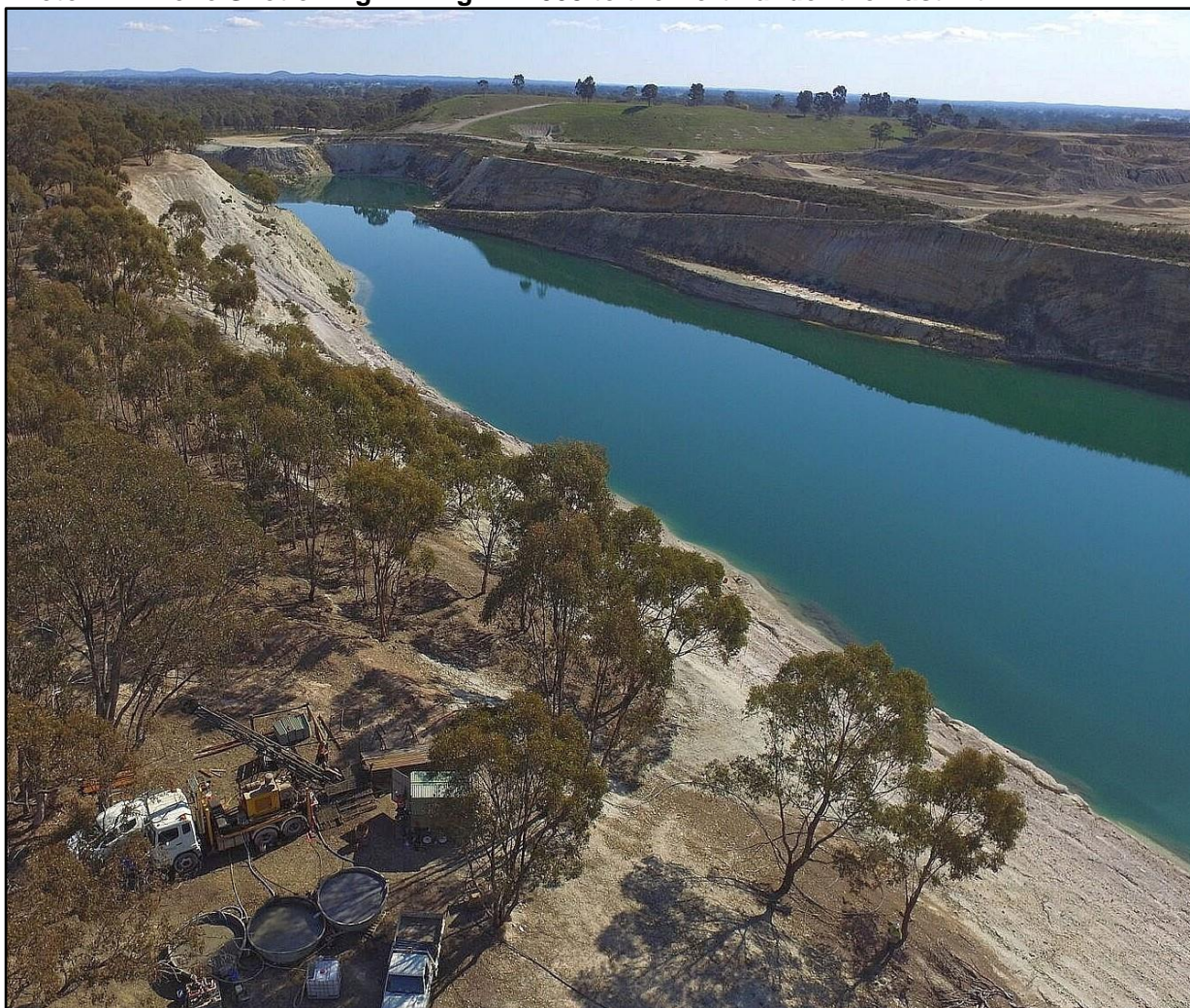
Photo 2 Drone Shot of Rig Drilling NAD003 to the North under the East Pit