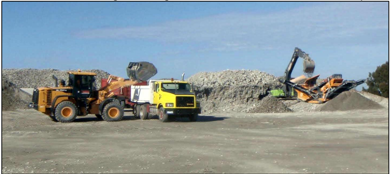
Photo 1 Global screening and loading crushed rock at the Eastern Overburden Dump

The Company is developing all the non-gold material opportunities on the freehold land at the Nagambie Mine in conjunction with Global Constructions Pty Ltd ("Global").